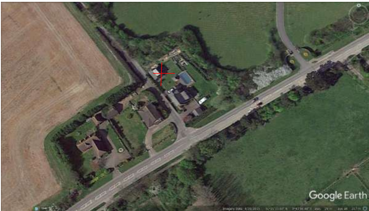
Plate 1. Aerial view of site (red target) showing the site prior to development.

(Google Earth 20/4/2015: Eye altitude 217m).