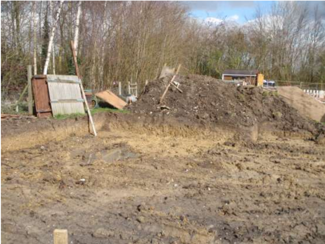
Plate 6. View of the ground reduction (looking NW)