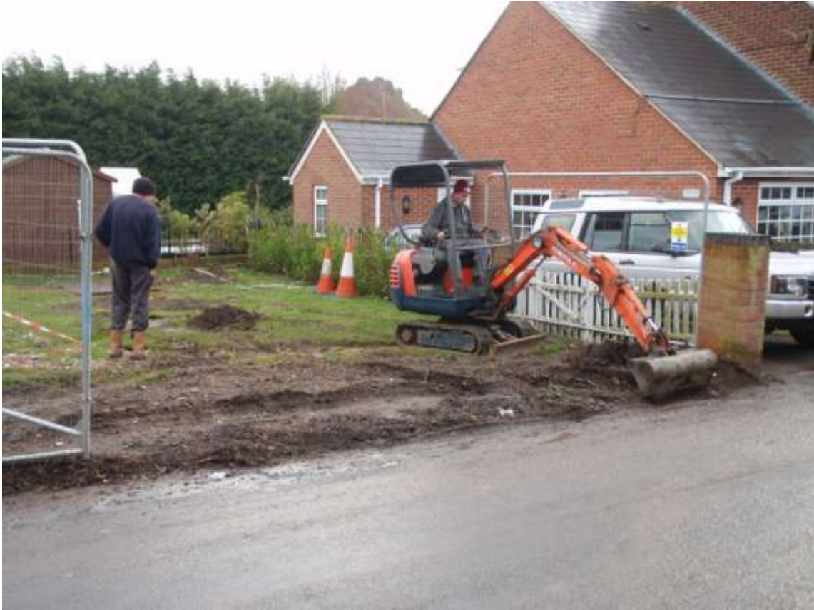
Plate 2. General view of site (looking NE)