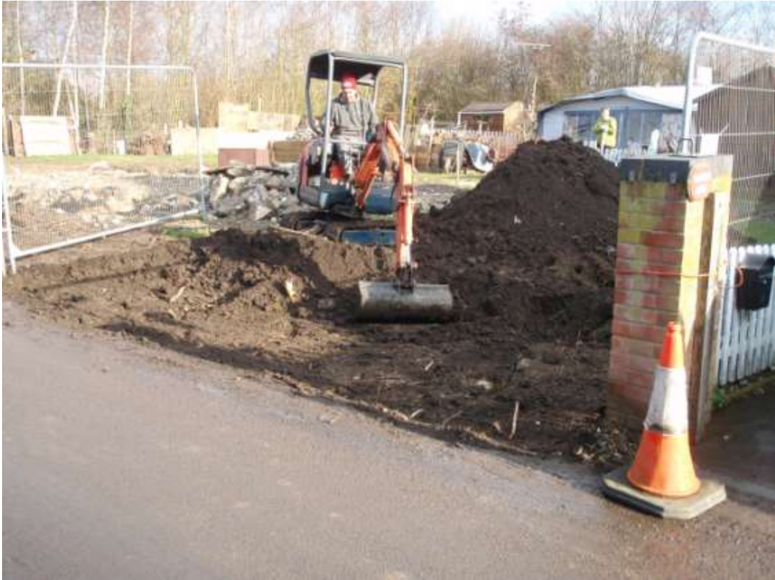
Plate 5. View of the ground reduction (looking NW)