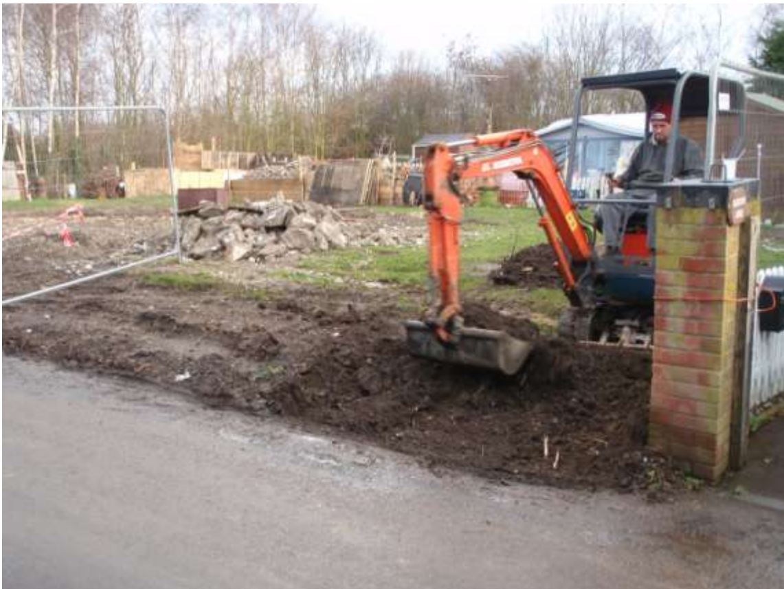
Plate 3. View of ground reduction at entrance (looking NW)