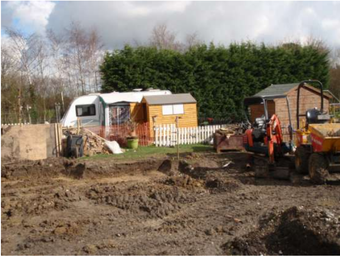
Plate 4. View of ground reduction of site (looking NE)